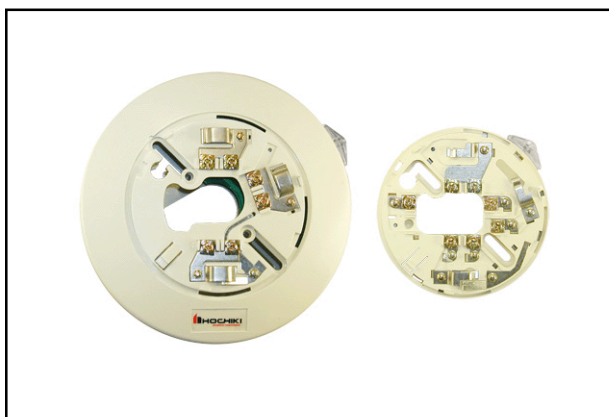
SCI-B6 & SCI-B4